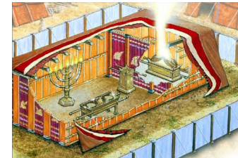
Acacia wood table